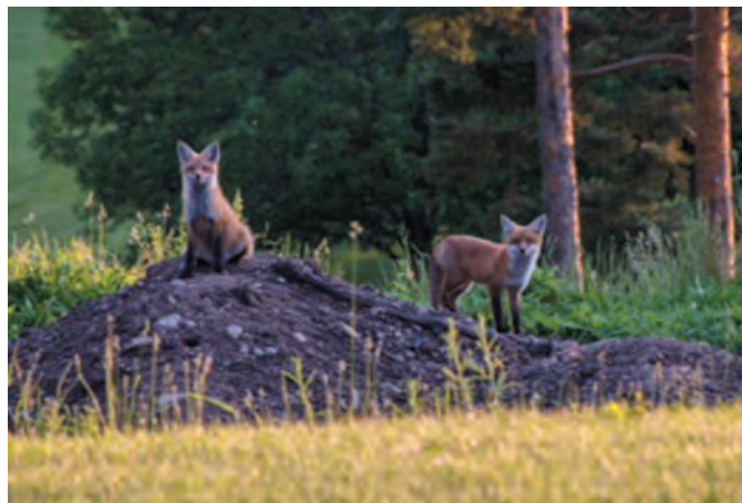
A pair of our resident red foxes.