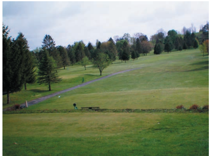
By Tuesday morning, April 24th, all of the snow had melted following the previous day's winter blast.